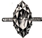
T6475 Diamond and Platinum.