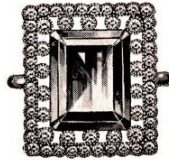
T6478 Emerald, Diamond and Platinum.